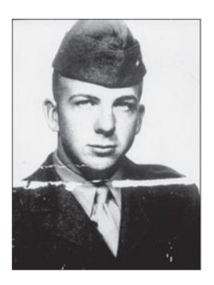
SADIE AND THE GENERAL