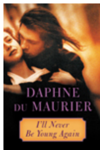
I'll Never Be Young Again