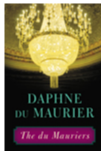
The du Mauriers