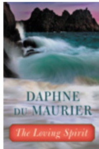
The Loving Spirit