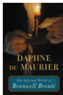
The Infernal World of Branwell Brontë