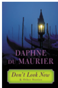
Don't Look Now and Other Stories