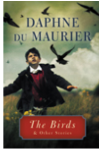
The Birds and Other Stories