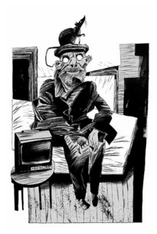
We have eyes and we have nerveses We have tails we have teeth You'll all get what you deserveses When we rise from underneath.

whispered a dozen or more tiny voices, in that dark flat with the roof so low where it met the walls that Coraline could almost reach up and touch it.