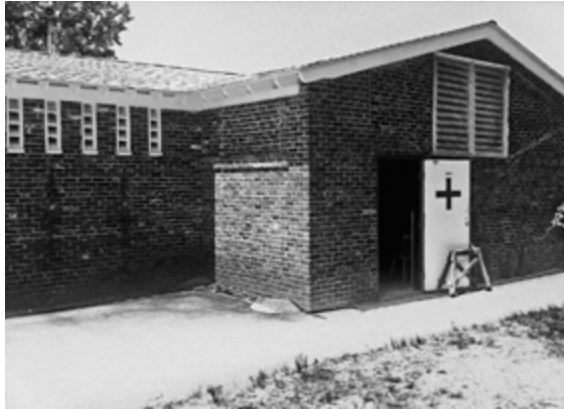
The scene of the cover-up.