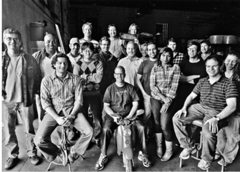
The season six writers and editors.