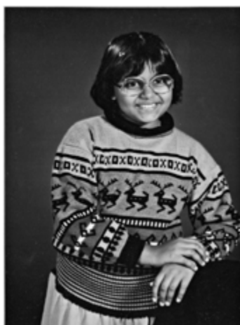
Cosby sweater on, lovin' life.

GETTING PROFESSIONALLY beautified was all that I dreamed about doing when I was an asexual-looking little kid. That's because my parents dressed both my brother and me according to roughly exactly the same aesthetic: Bert from Ernie and Bert. Easing them out of dressing me in primary colors and cardigans (seriously, I was a child who wore cardigans ) and getting them to let me grow my hair out past my earlobes was a first huge step that took years.