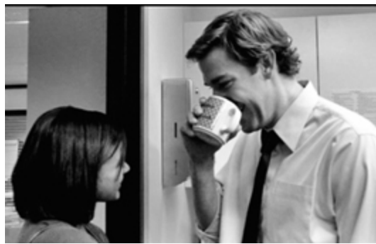
John Krasinski and I, professional actors, unable to complete a scene without laughing.

People ask me all the time how I got hired onto The Office . Another common question is how do I manage to stay so down-to-earth in the face of such incredible success? This I can't explain. It probably has something to do with innate goodness or something. A third frequently asked question is: "Girl, where you from? Trinidad? Guyana? Dominican Republic? You married? You got kids?" This is mostly asked by guys on the sidewalk selling I LOVE NEW YORK paraphernalia in New York City.