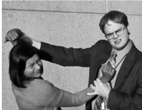
Rainn Wilson, violent ogre.

it this way. Van Nuys took one look at Panorama City and was like, “Uh, get your own name. We don’t want to have anything to do with you.”