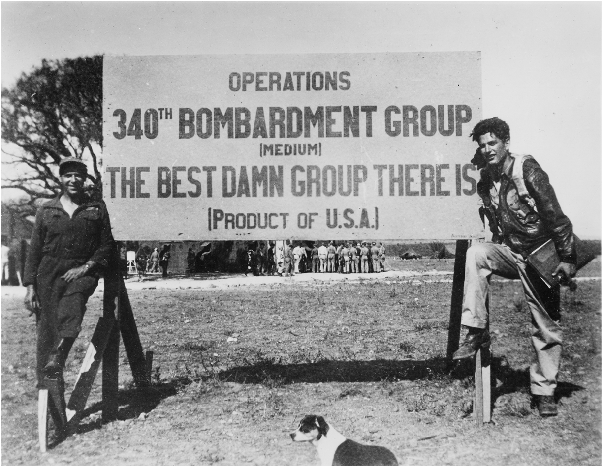
A photograph from Joseph Heller's copy of the 488th Squadron's unofficial scrapbook. Heller is on the right.

But in 1953, Heller was still searching for the right form and style of expression. In literature, he found himself attracted to the innovative work of Waugh, Nabokov, and Céline for their successes in achieving the kind of effect Heller wanted. In an early post-publication interview, Heller used Nabokov's work to describe the effect he himself was searching for: "Nabokov in Laughter in the Dark takes an extremely flippant approach to situations deeply tragic and pathetic, and I began to try for a similar blending of the comic and the tragic so that everything that takes place seems to be grotesque yet plausible." 2