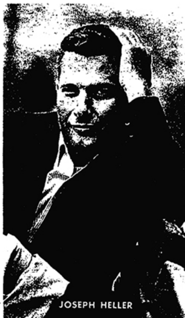
Photograph of the author

"I don't think I'll ever recover... But before I die of Catch-22 , I will do everything to keep it alive. I will change ads on subways to: 'Promise her anything but give her Catch-22 .' I'll write