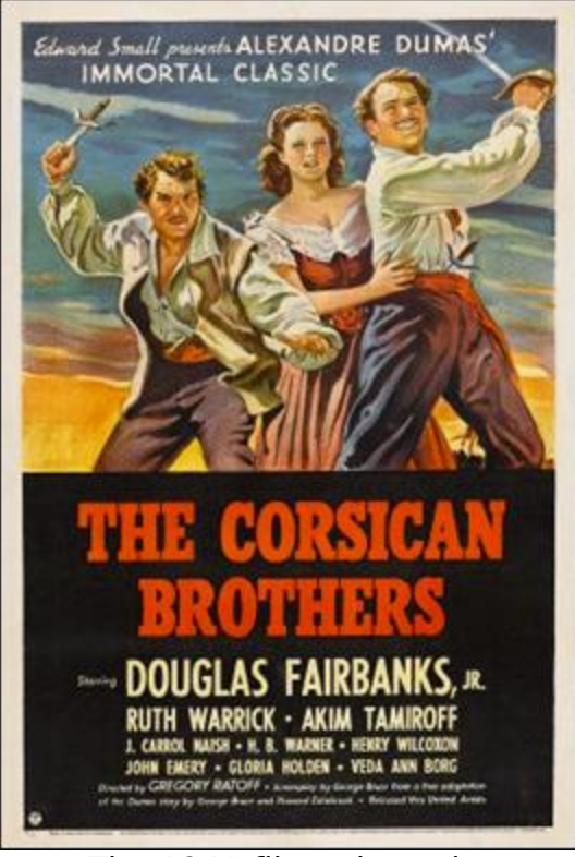
The 1941 film adaptation