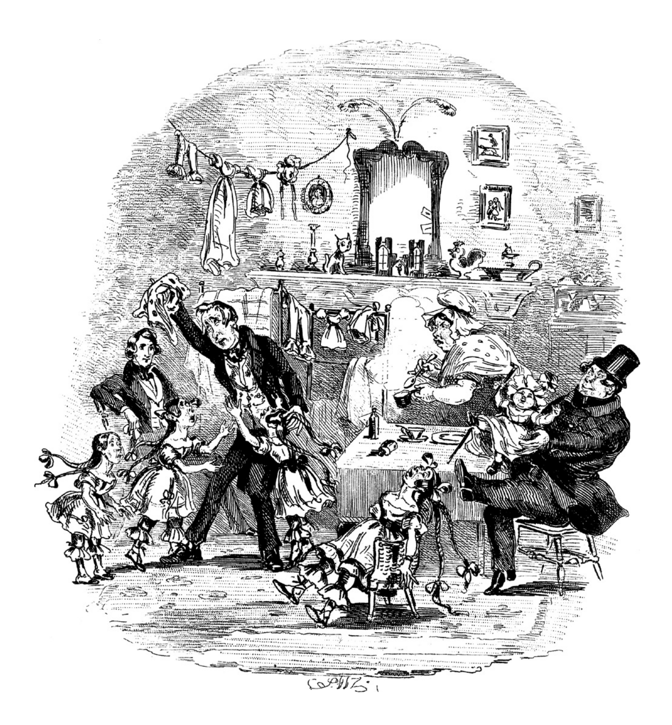
Emotion of Mr Kenwigs on hearing the family news from Nicholas