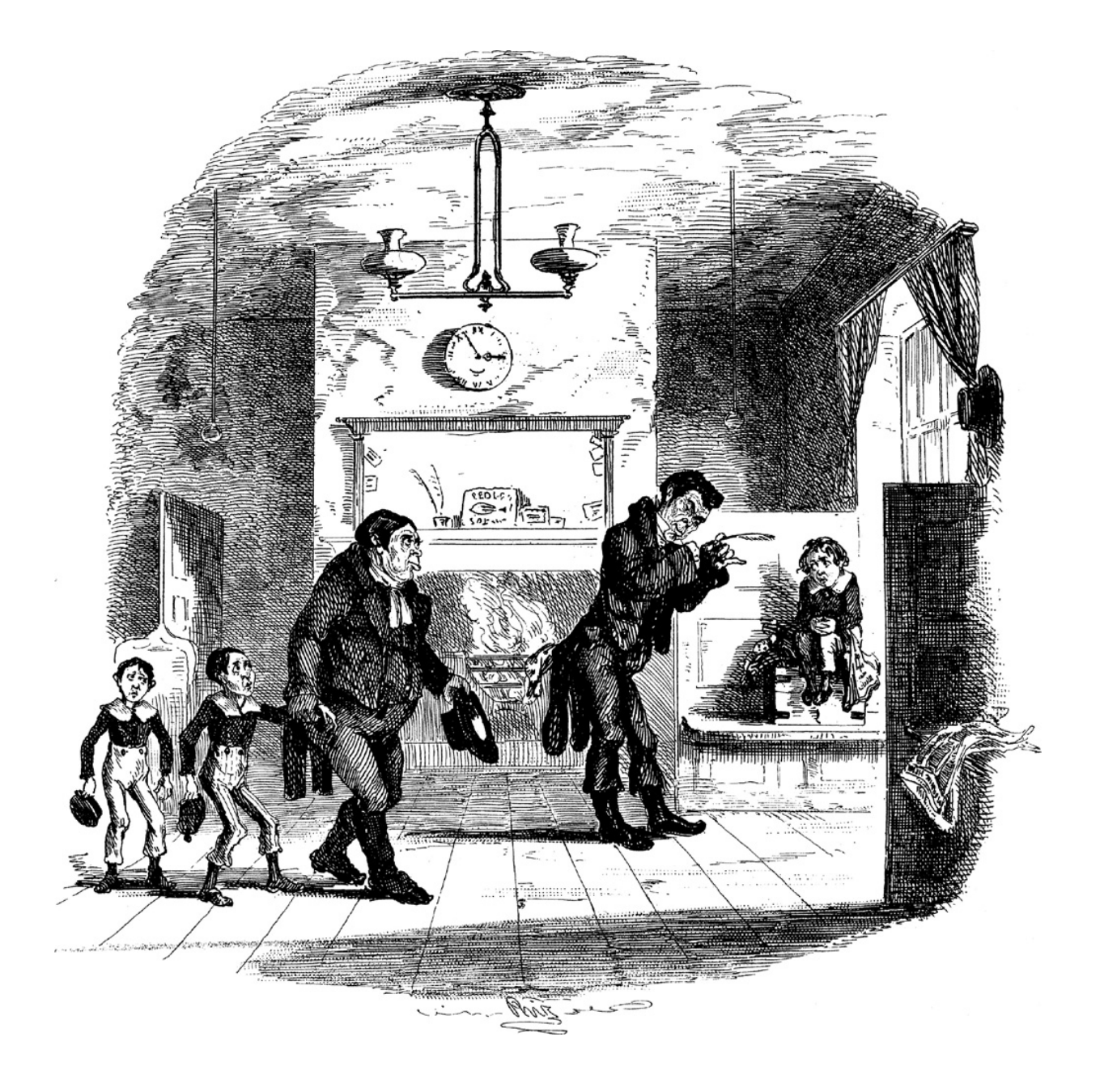
The Yorkshire Schoolmaster at The Saracen's Head